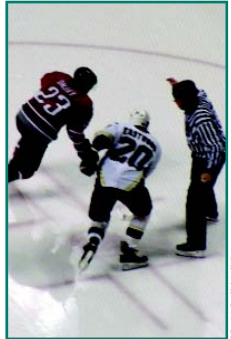
SONY Staff / Jeff Foley

In a perfect ending to a perfect night, the 100 SONY athletes, volunteers, coaches and family members donned their Sabres caps and joined the sold-out crowd cheering the Sabres on to a 5-1 route of Pittsburgh. ■ JF