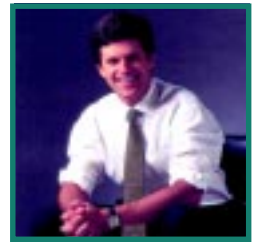
Special Olympics President and CEO Tim Shriver

Those are Sam Dawson's priorities. As you watch the movie and realize who Sam is, you may find yourself revisiting yours. ■