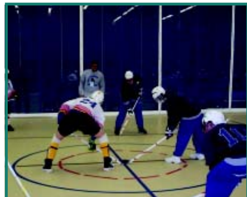
Manhattan and Bronx Floor Hockey teams faced off at the Jacob Javits Convention Center (left). Manhattan brought home the Gold. The competition was just as fierce in Seneca Falls (right). Here Areas 16 and 24 wait for the whistle. Teams wishing to compete at the Winter Games must compete at one of these Sectionals.