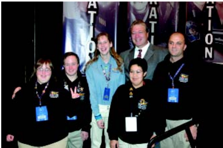
Olympic Gold Medalist and Honorary Coach Jeff Blatnick with our Special Olympics gang.