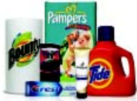
Purchase these and other P&G brands and support Special Olympics.

P&G has been a proud supporter of Special Olympics for 27 years with over $37 million in donations. For each participating product you buy from December 31, 2006 through January 31, 2007, P&G donates 10¢ to Special Olympics, up to $500,000 total.