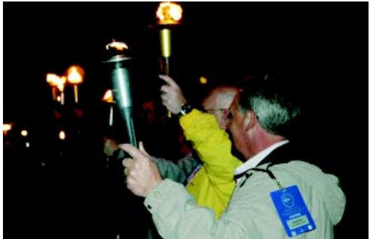
Torch Ceremony - A torch represented each of the 25 years of LETR.