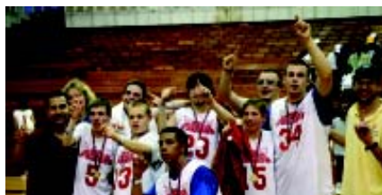
The Adirondack Warriors; consisted of athletes from Clinton and Essex counties; and they defeated the Saratoga Devil Dogs, 28-18 in the Summer Games Highlight game.